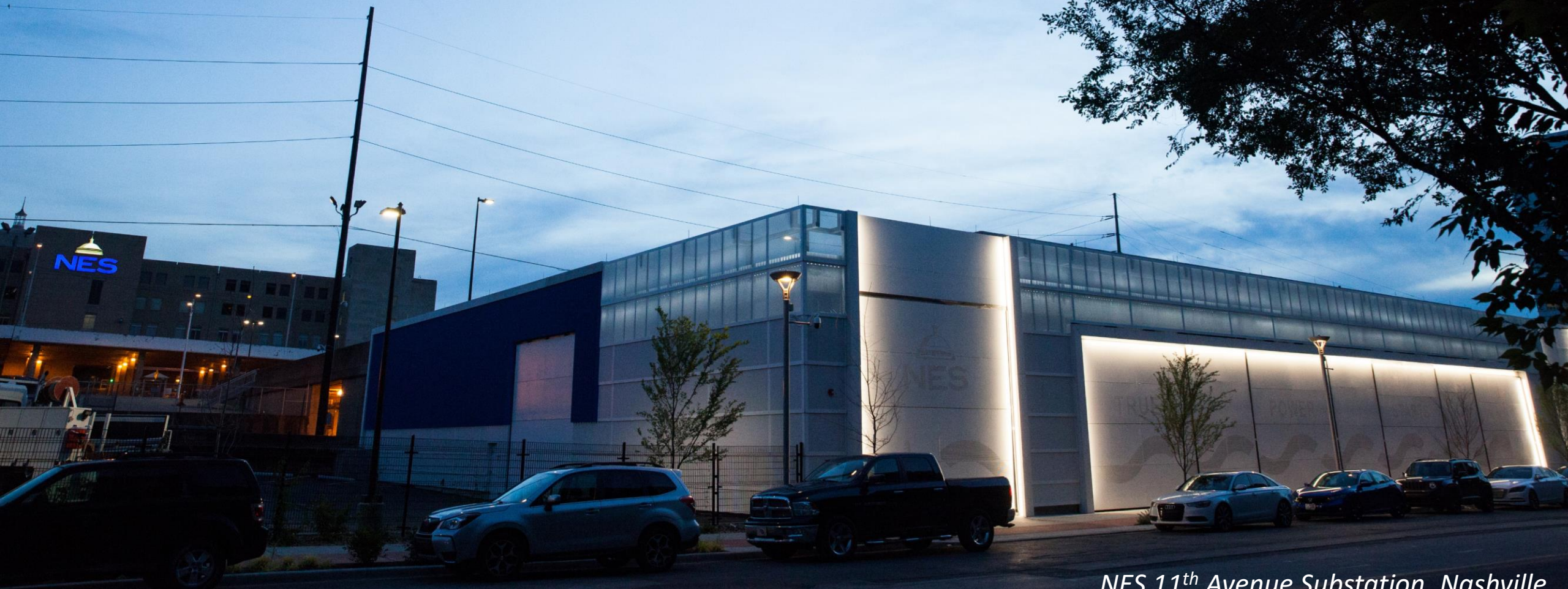
NES 11 th Avenue Substation, Nashville